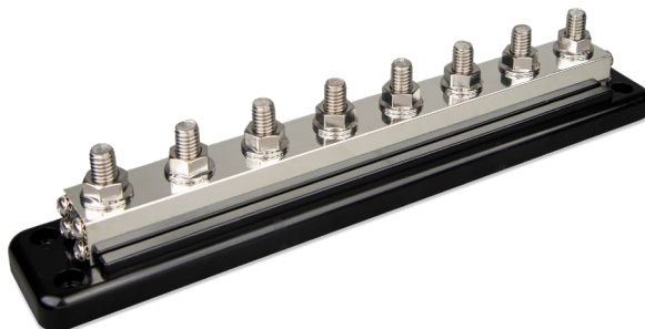
Busbar 600 A with 8 high current terminals and 8 low current screw terminals, without cover